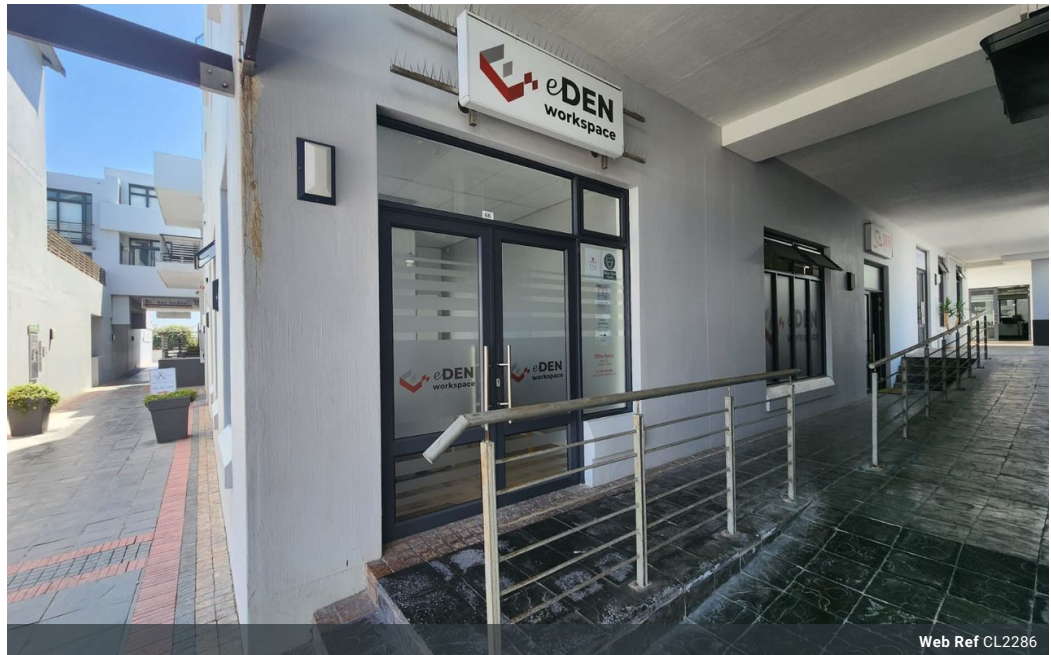
Web Ref CL2286

Unit A9 Spearhead Business Park Montague Drive Montague Gardens, 7441 Western Cape South Africa