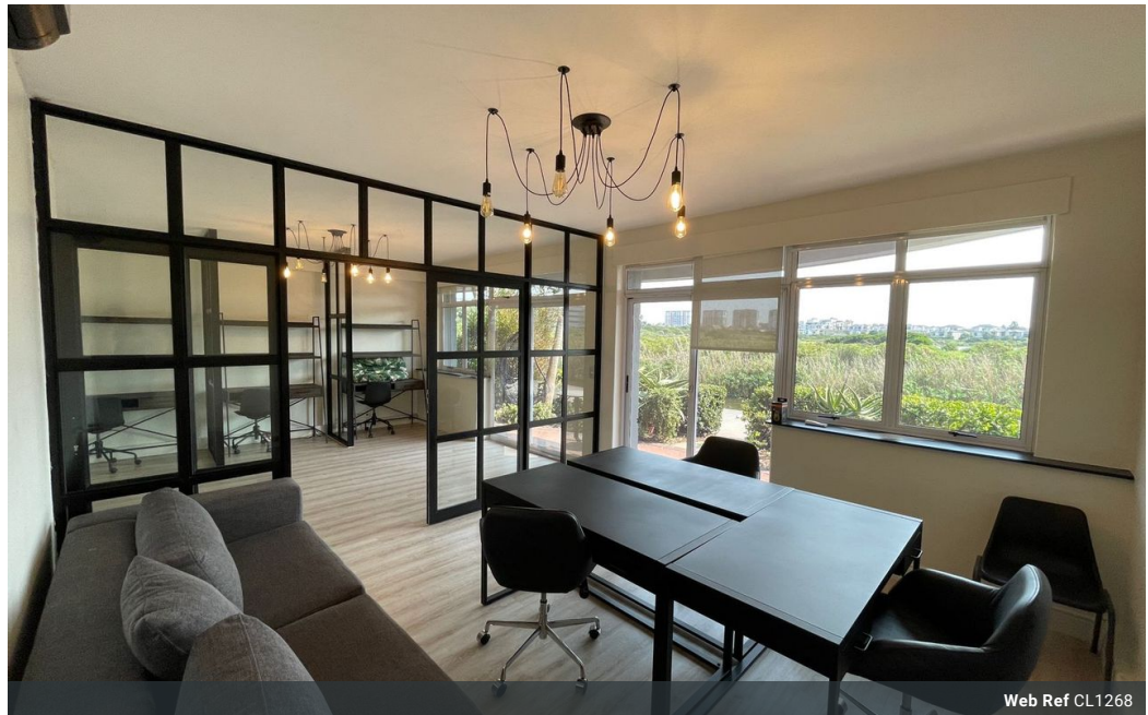
Web Ref CL1268

Unit A9 Spearhead Business Park Montague Drive Montague Gardens, 7441 Western Cape South Africa