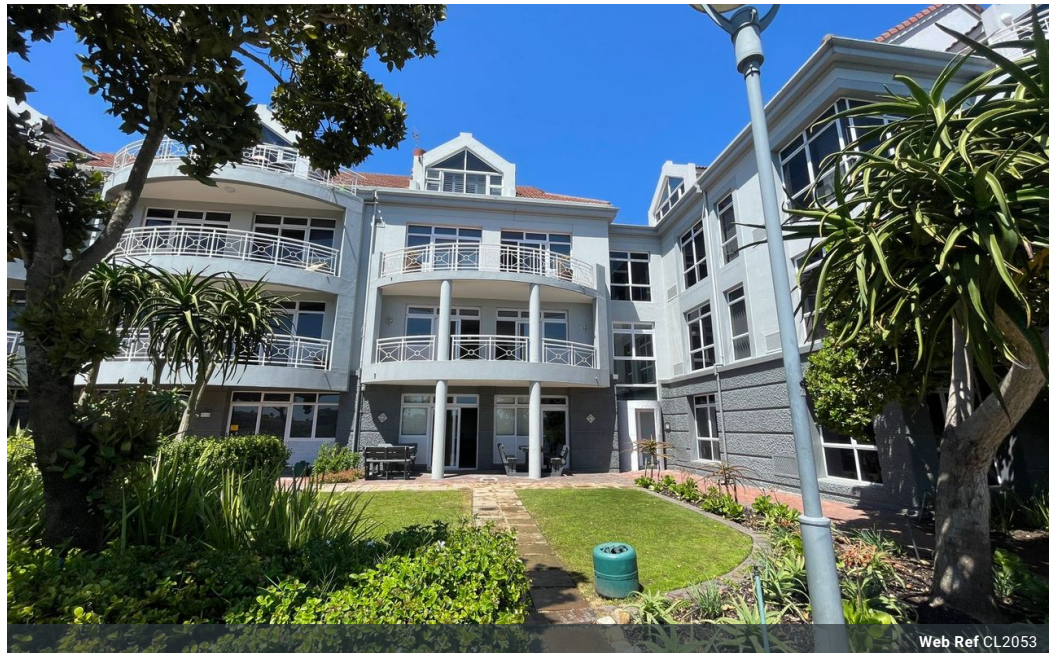
Web Ref CL2053