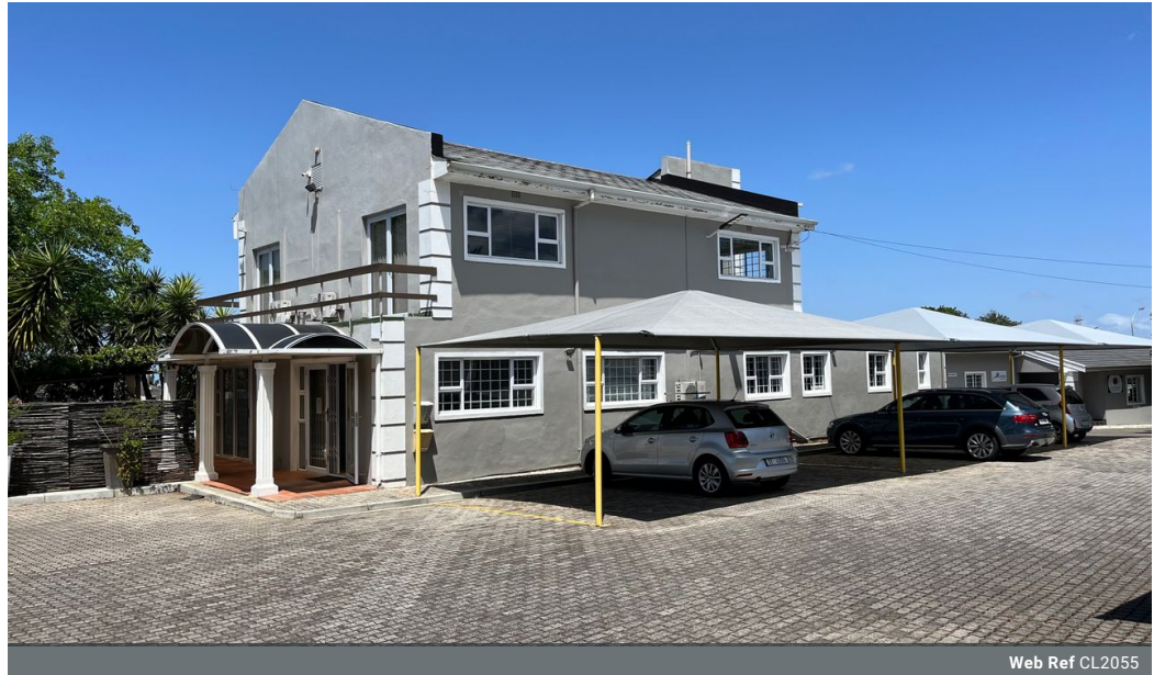
Web Ref CL2055