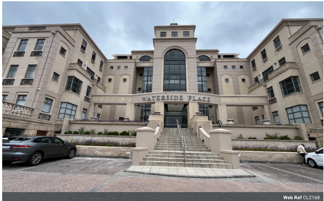
Web Ref CL2168