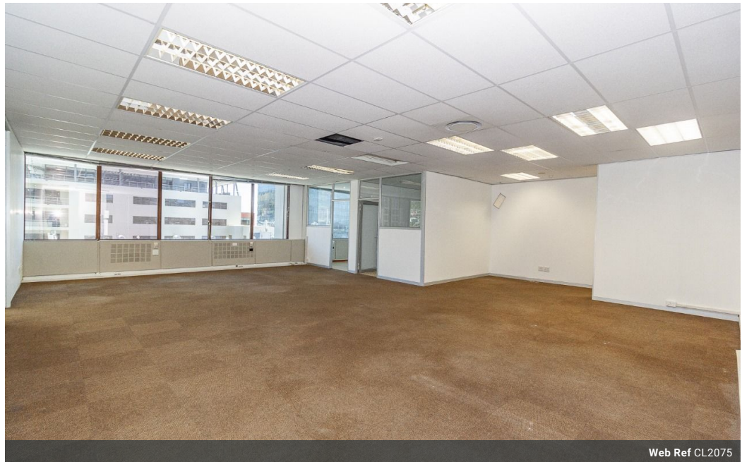
Web Ref CL2075

Unit A9 Spearhead Business Park Montague Drive Montague Gardens, 7441 Western Cape South Africa