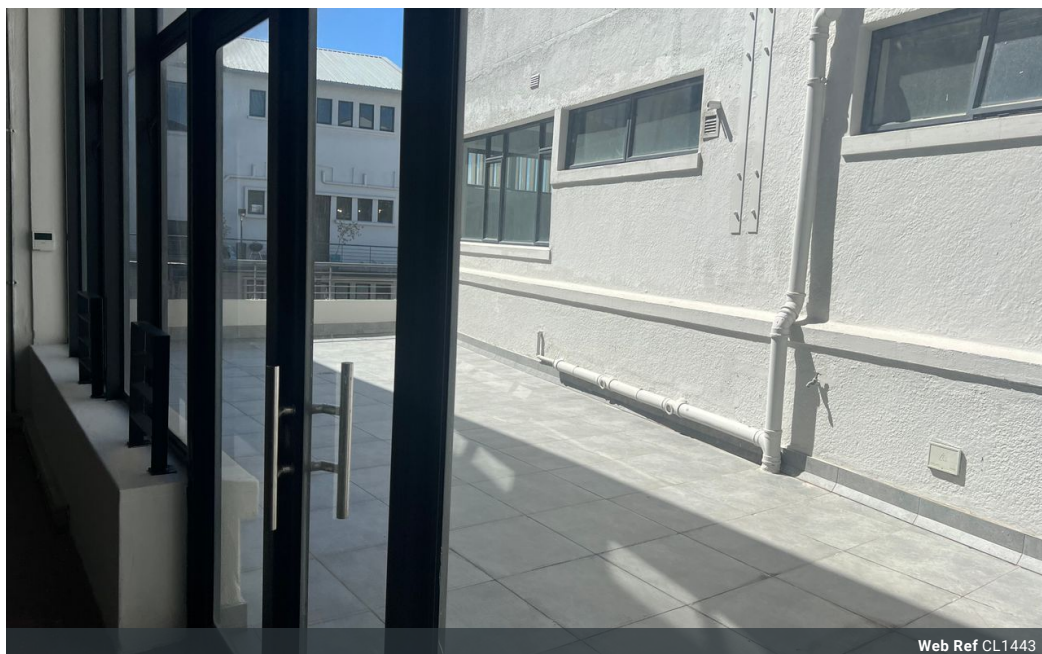
Web Ref CL1443