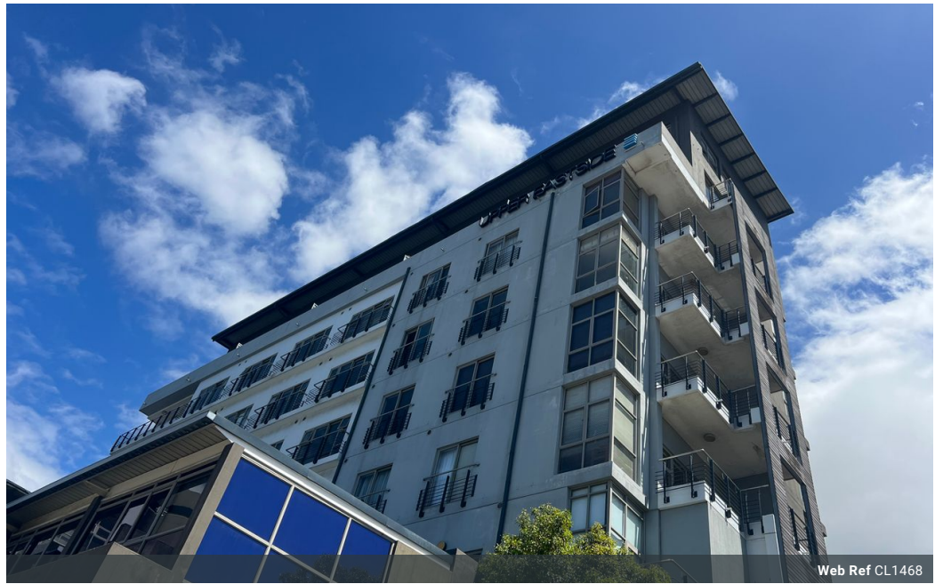
Web Ref CL1468