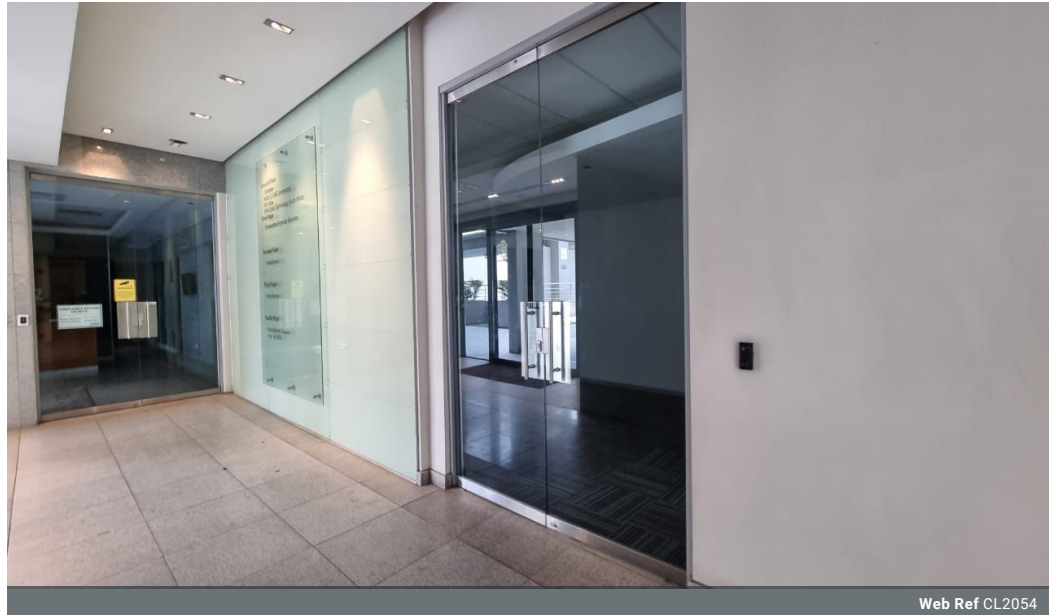
Web Ref CL2054

Unit A9 Spearhead Business Park Montague Drive Montague Gardens, 7441 Western Cape South Africa