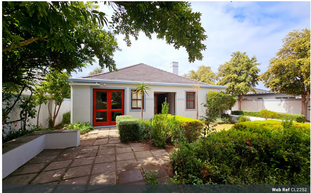
Web Ref CL2252

173 Main Road Hermanus Western Cape 7200