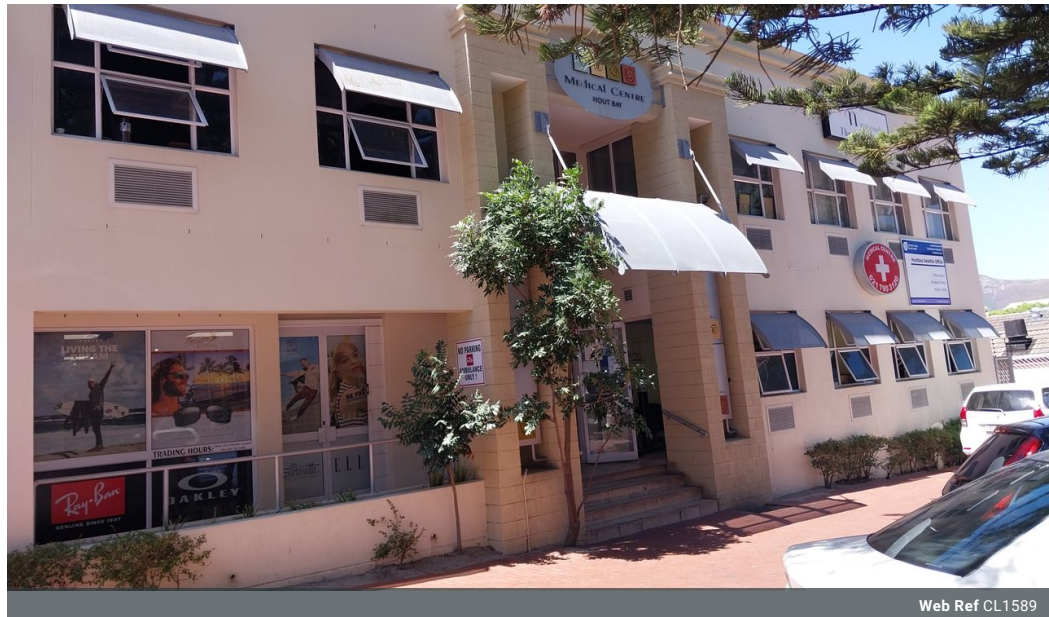
Web Ref CL1589

Shop B5 Mainstream Mall Corner Princess Street and Main Road Hout Bay Cape Town, 7806 Western Cape, South Africa