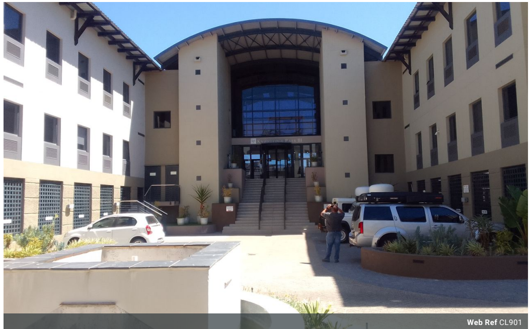
Web Ref CL901