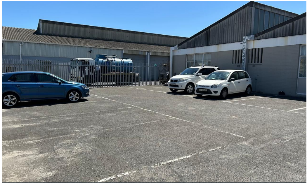
Web Ref CL2210