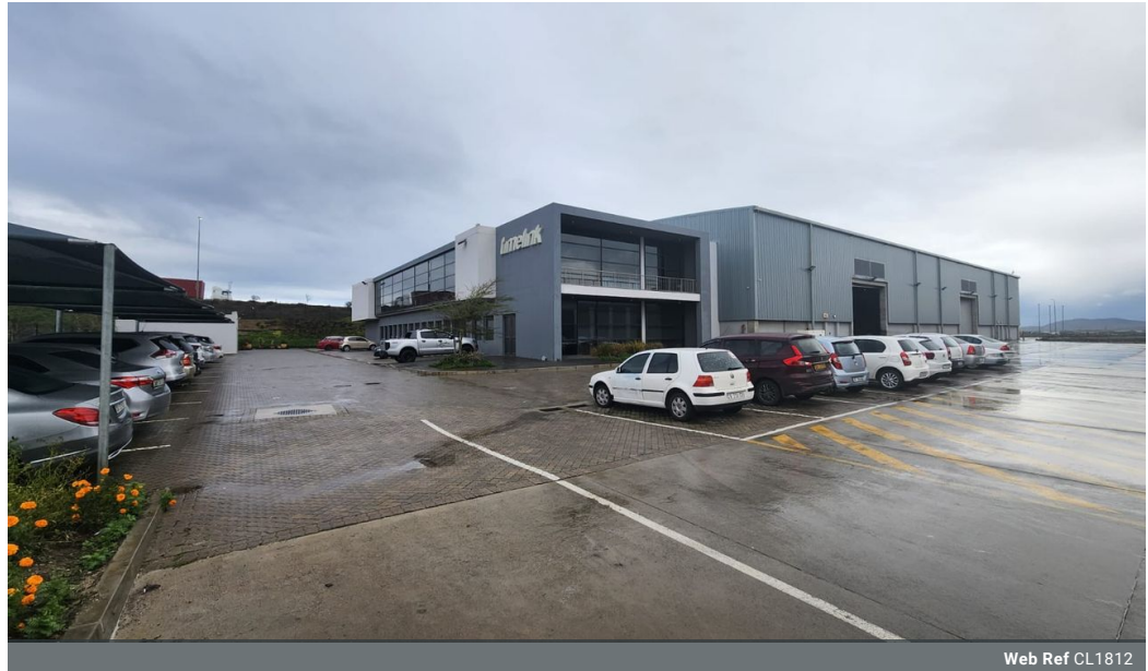
Web Ref CL1812

Unit A9 Spearhead Business Park Montague Drive Montague Gardens, 7441 Western Cape South Africa