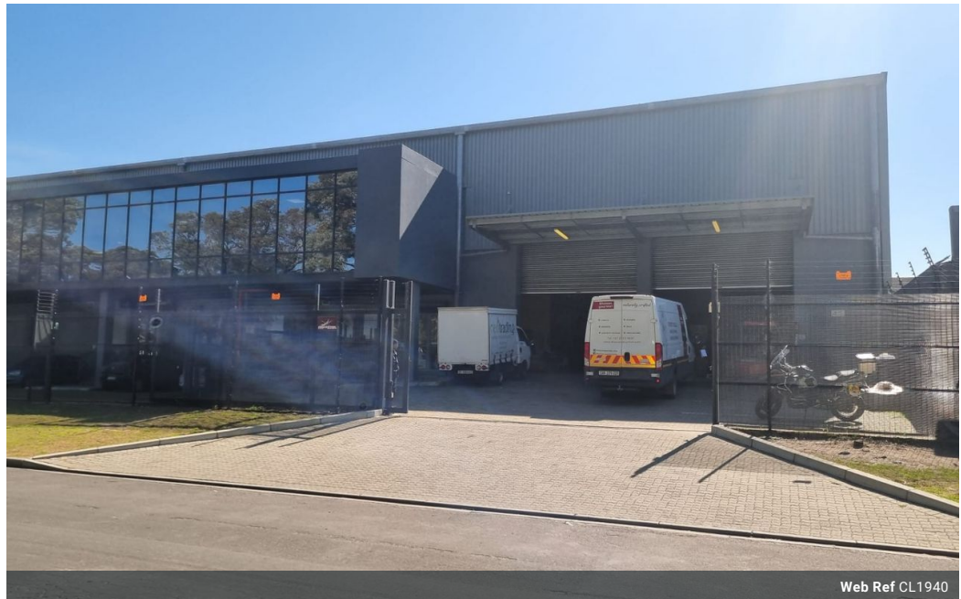
Web Ref CL1940

Unit A9 Spearhead Business Park Montague Drive Montague Gardens, 7441 Western Cape South Africa