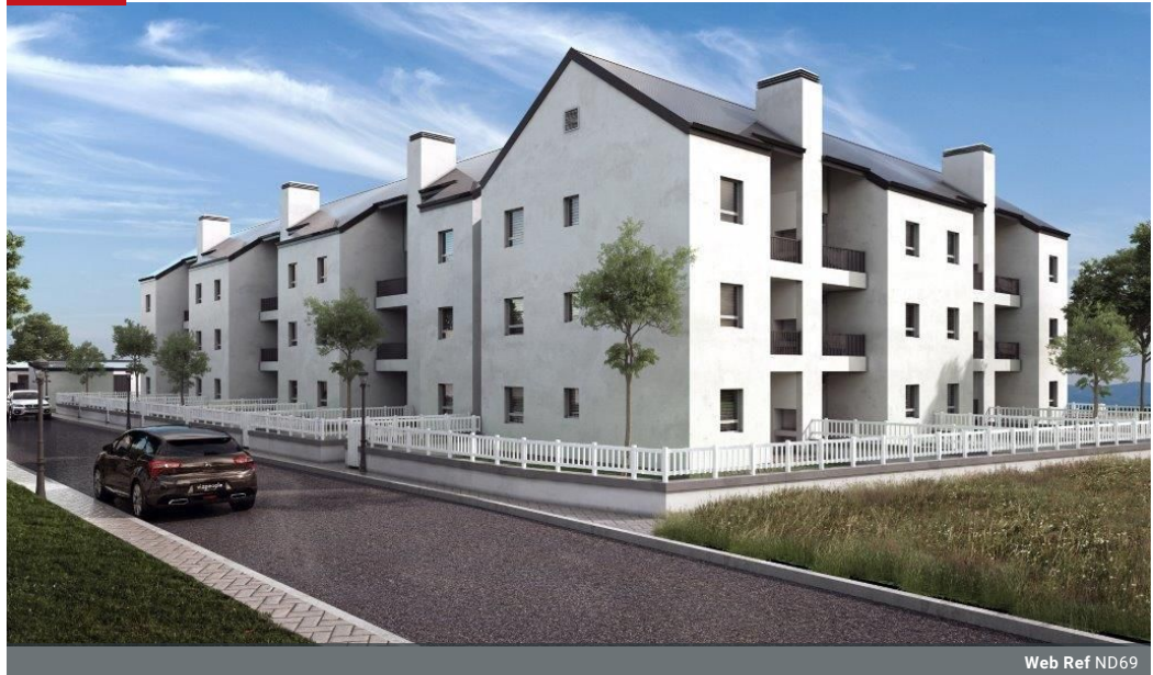
Web Ref ND69