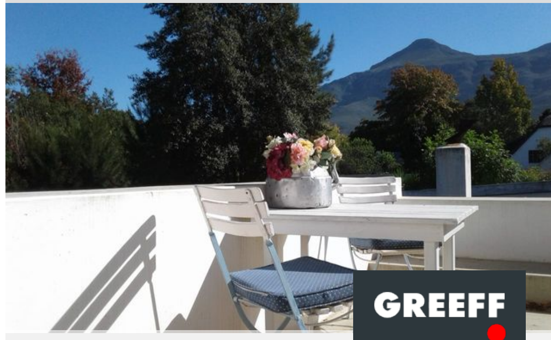
● Caledon, Greyton