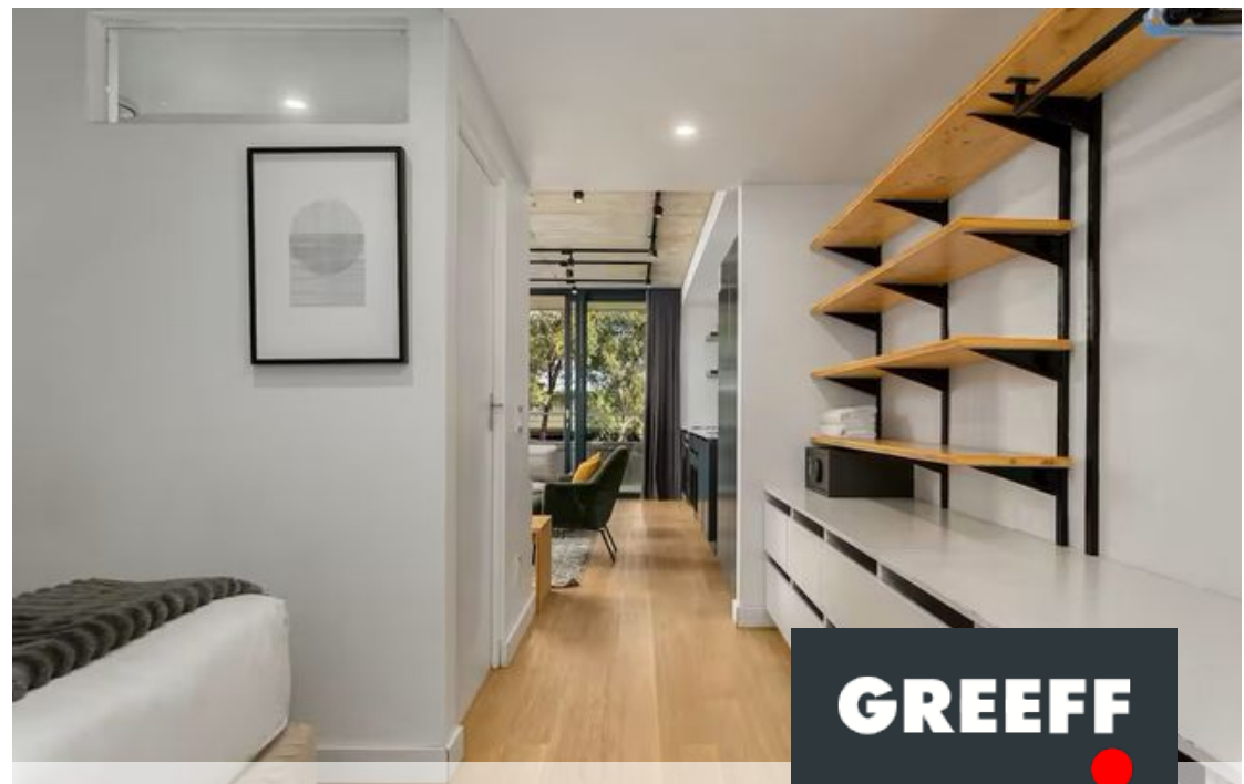
● Cape Town, Bo Kaap