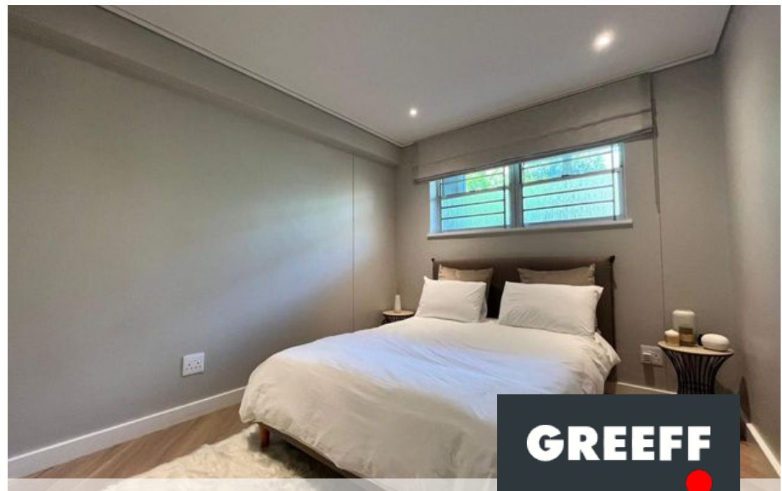
● Cape Town, Camps Bay