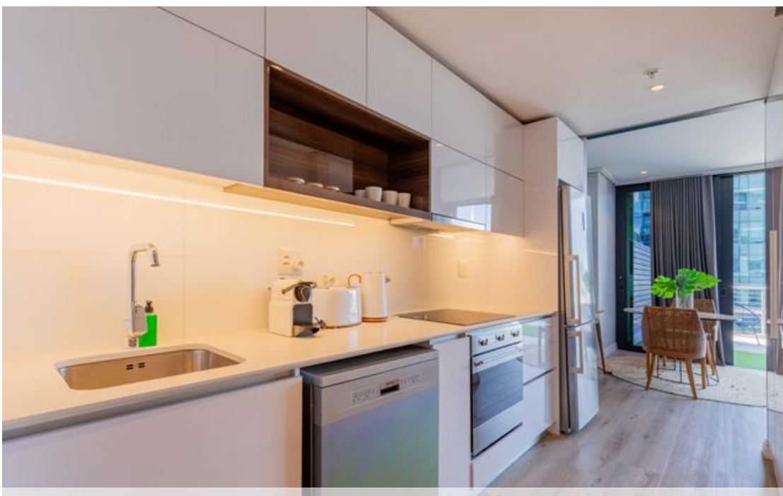
Web Ref RL23964 https://www.greeff.co.za