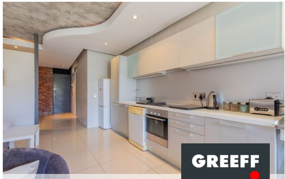
● Cape Town, De Waterkant