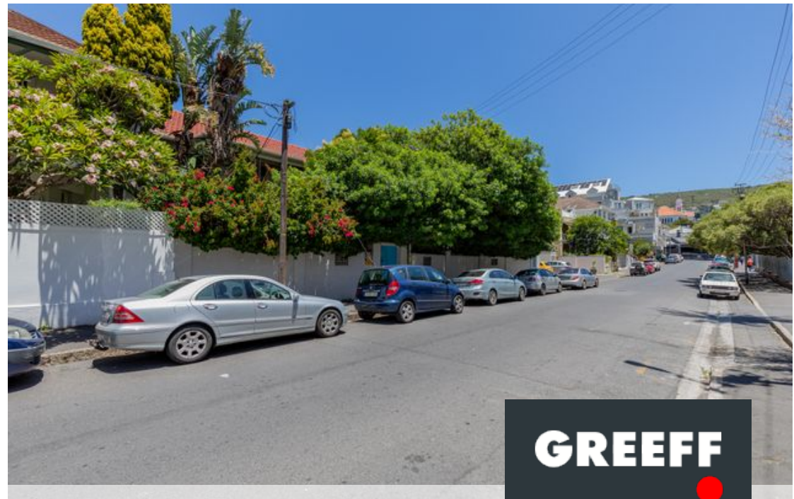
● Cape Town, Gardens