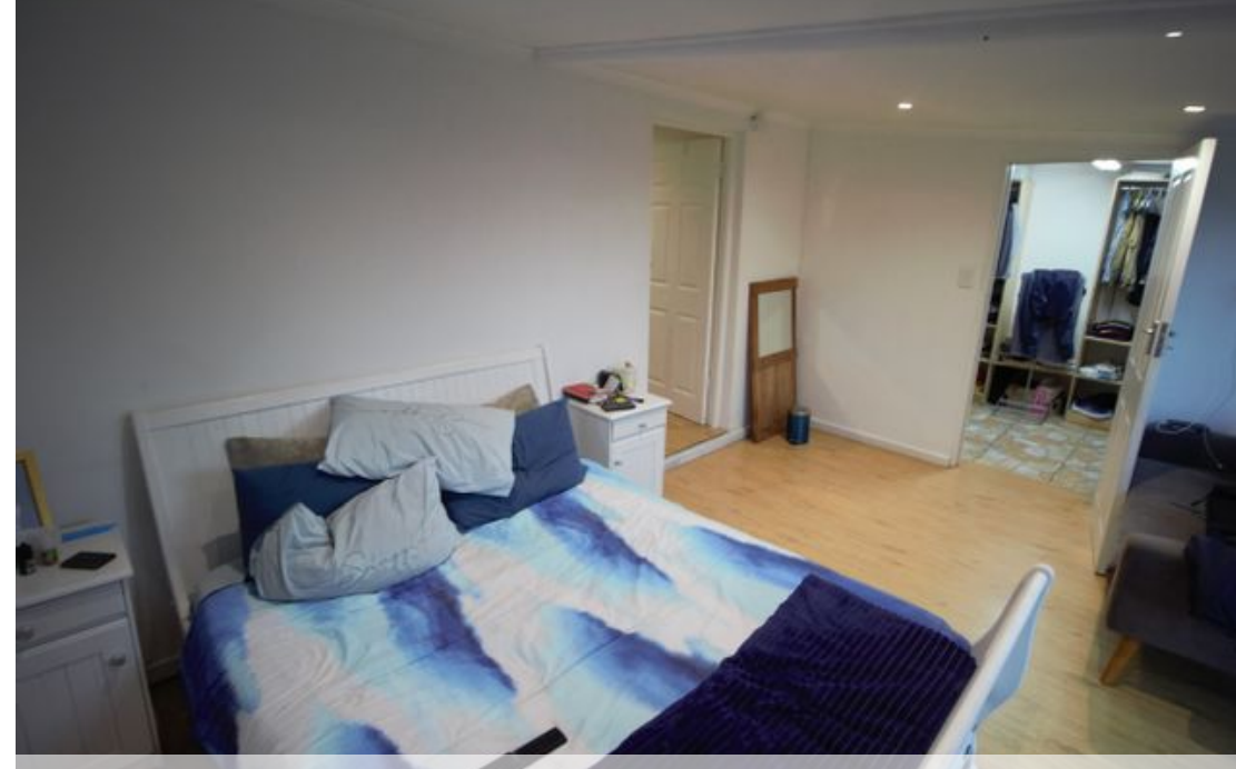
Web Ref RL24369 https://www.greeff.co.za