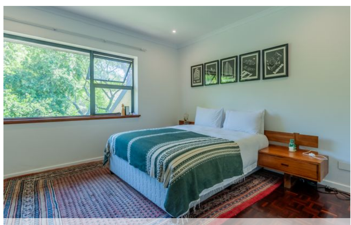
Web Ref RL21999 https://www.greeff.co.za