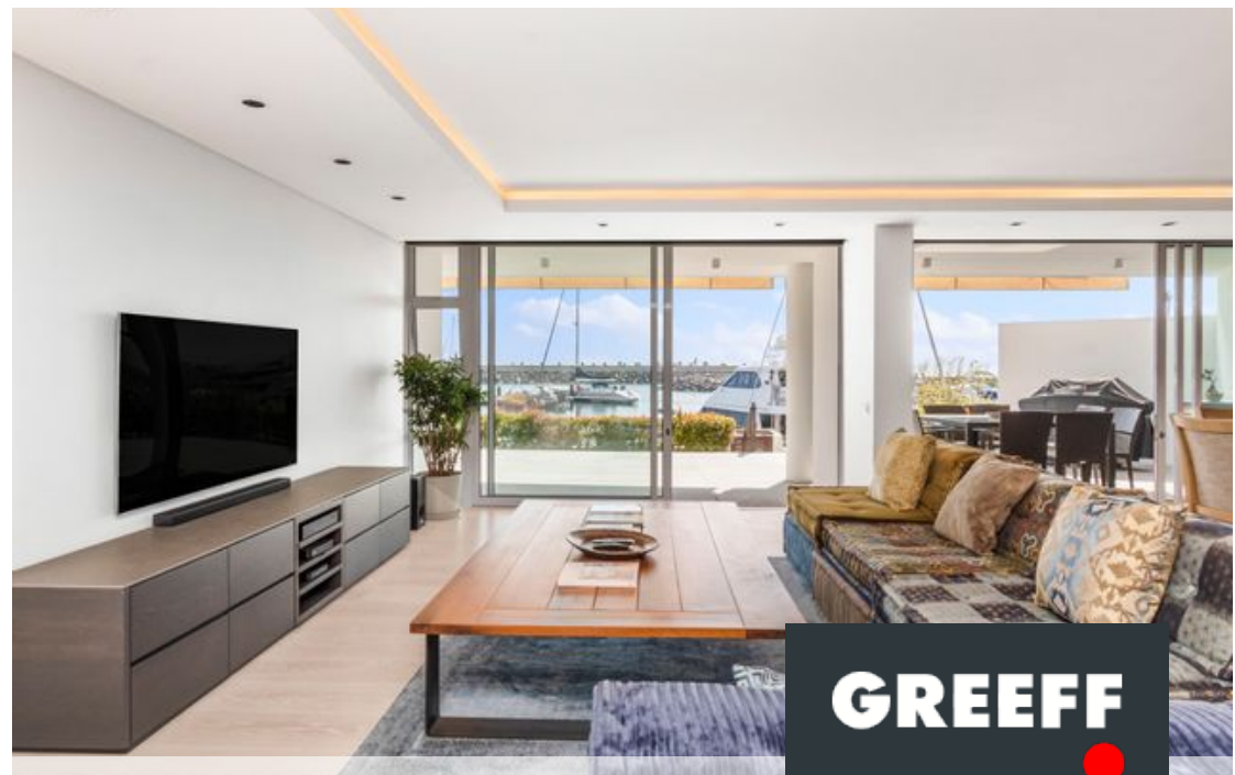
● Cape Town, Mouille Point