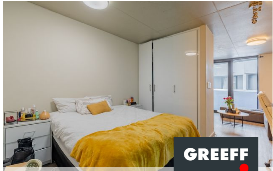
● Cape Town, Observatory