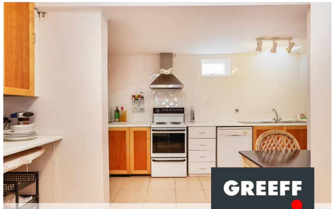
● Cape Town, Oranjezicht