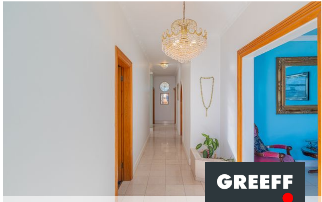
● Cape Town, Walmer Estate