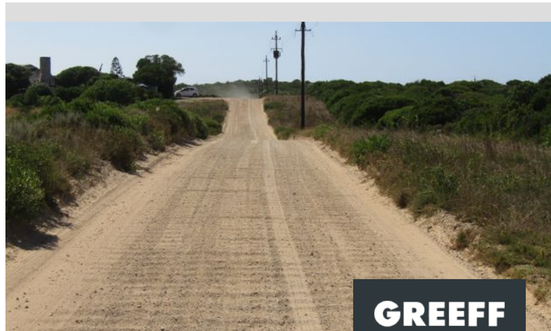
● Gansbaai, Birkenhead