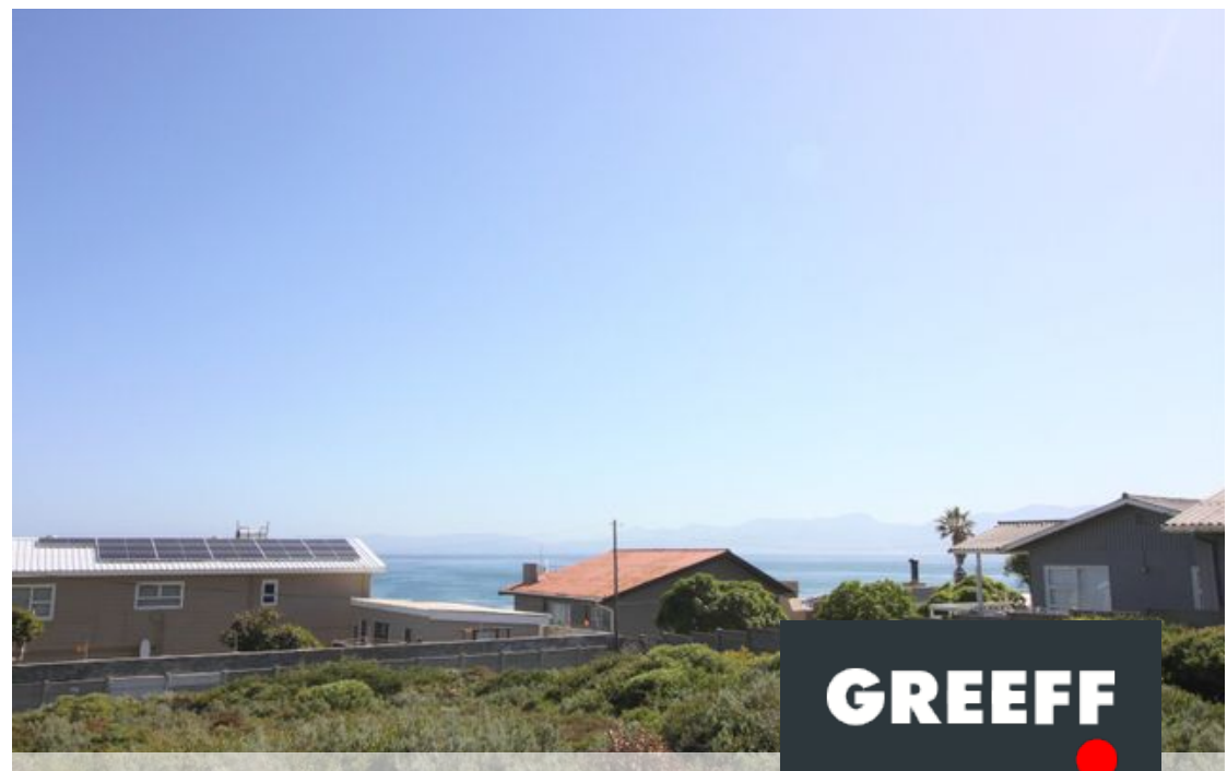
● Gansbaai, Perlemoenbaai