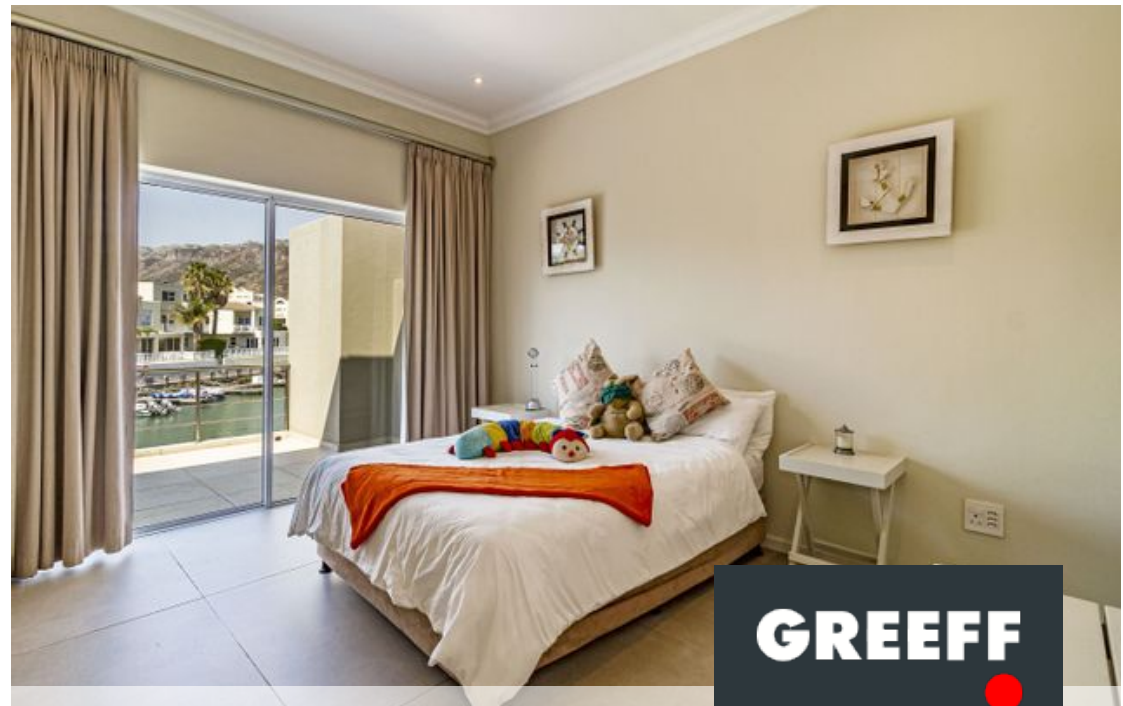
● Gordons Bay, Harbour Island