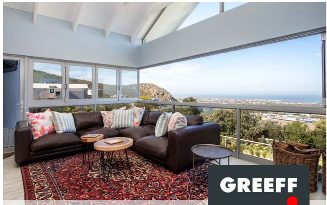
● Hermanus, Chanteclair