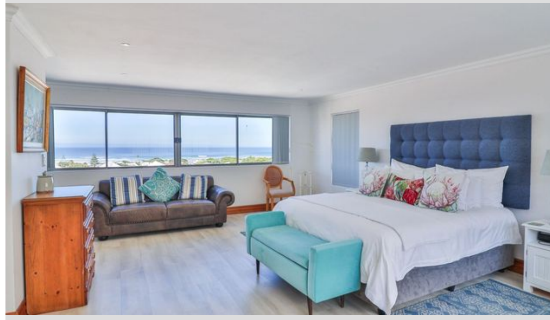
Web Ref 4176377 https://www.greeff.co.za