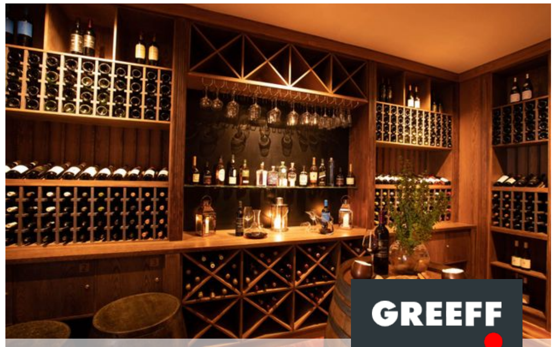
● Jansenville, Jansenville Rural