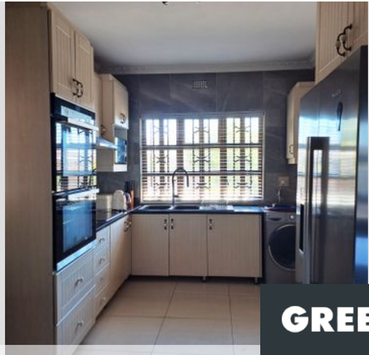
● Mitchells Plain, Mandalay