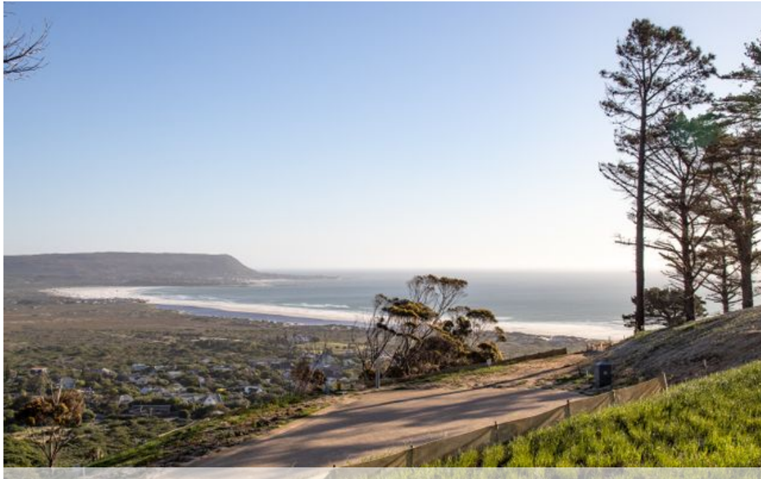
Web Ref RL24342 https://www.greeff.co.za