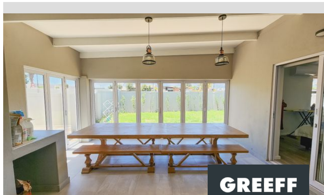
● Paarl, Mountain Crest Private Estate