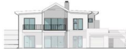
Back Elevation 1 : 100