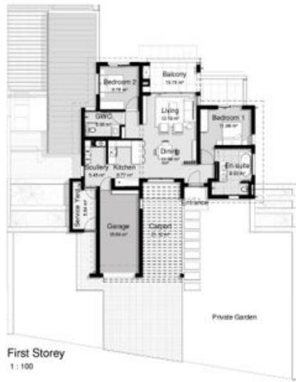
First Storey 1 : 100