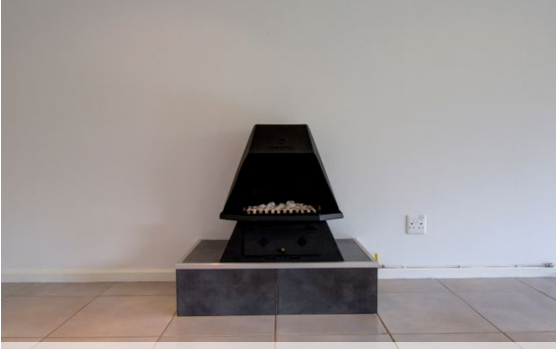
Web Ref RL24329 https://www.greeff.co.za