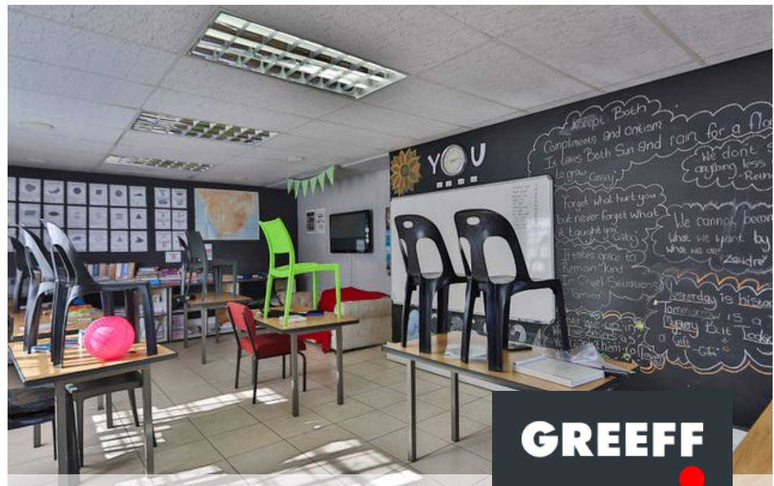
● Somerset West, Audas Estate