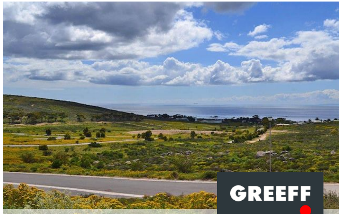
● St Helena Bay, St Helena Views