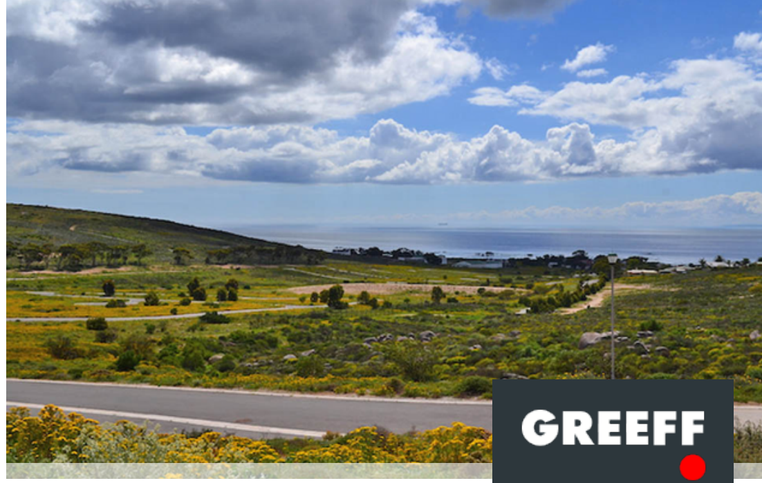
• St Helena Bay, Steenbergs Cove