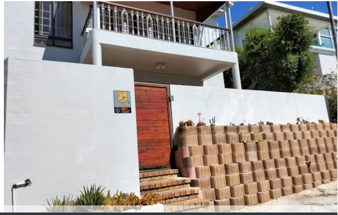
Web Ref RL24304 https://www.greeff.co.za