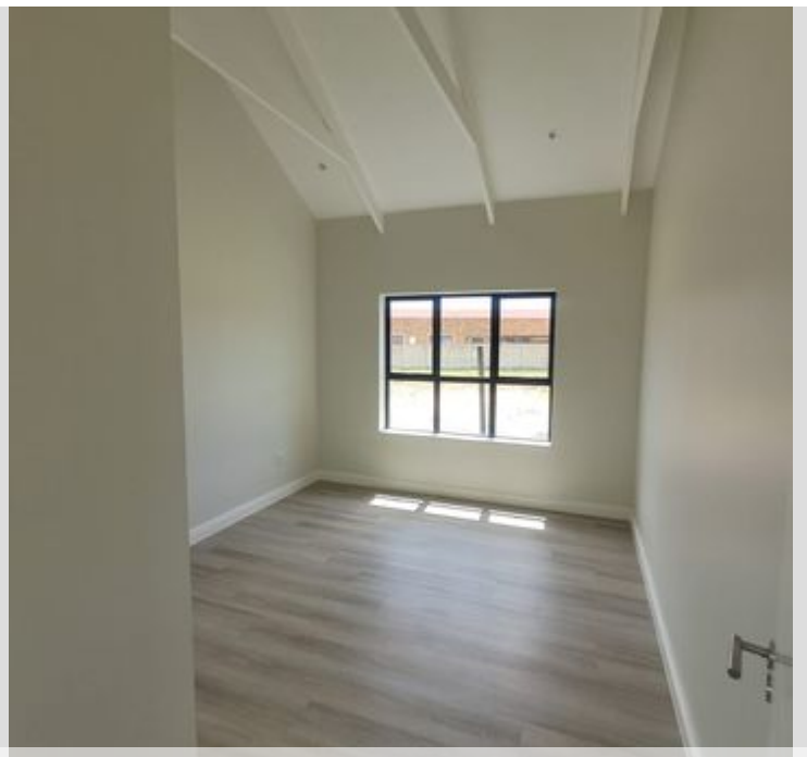
Web Ref RL24116 https://www.greeff.co.za